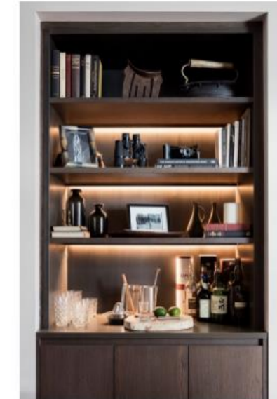
Wardour Street project by Design Haus Liberty