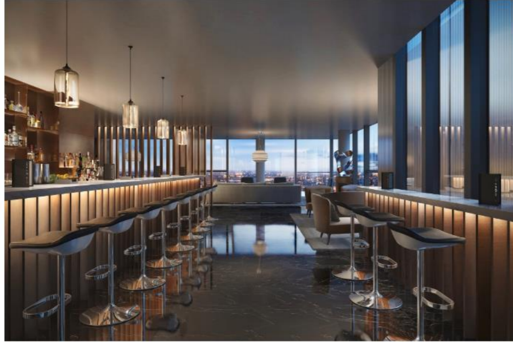
South Quay Plaza

"Luxury lifestyle is about having choices and having the best of these at your fingertips. Being able to enjoy a drink in the luxury of a bar on your doorstep allows you all the indulgence without any of the inconvenience. There is something special that makes an occasion out of still 'going out' but with all the comfort of 'staying in'.