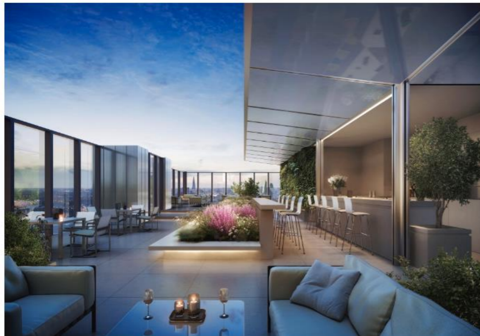
South Quay Plaza

This is one of the reasons why we are creating an amazing bar and lounge at South Quay Plaza. The concept of a home bar is nothing new but having an exclusive bar just an elevator ride away from where you live takes this to a whole new level. We've carefully considered how our residents will be living in the homes we build, how and where they are socialising and what they want from their home. There are some home owners who want to host but without all the fuss that goes with it, having a private bar in your building gives you access to the most trend setting cocktail mixologist who can create a signature drink in just seconds; no doubt making you the envy of your friends."