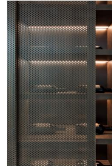
Wardour Street project by Design Haus Liberty; - Photograph by Philip Durrant

Park Crescent apartment project, London (Title Image)