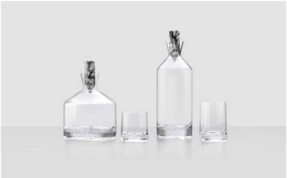
Alba decanter from £72 by Joe Doucet nudeglass.com

Open-plan spaces that can be partitioned off are a great way to make your home more entertaining-friendly if you're renovating or extending, but even if you're not, there are smaller details that might be easier to incorporate.