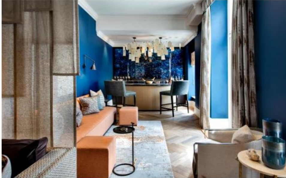
The King's Library in Chelsea

While it may be relatively straightforward to incorporate a small entertaining space for a businesslike tête-à-tête, it's harder to combine an intimate home suitable for everyday living with a big open space for a few dozen partygoers.