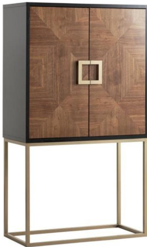
Puccini cocktail cabinet £1999 by John Lewis johnlewis.com

Spinocchia Freund’s penthouse apartment for Land Securities’ Kings Gate building in London’s Victoria offers a good example of the kind of layout that wealthy, sociable buyers are looking for. The open-plan ground floor has several different seating areas. In the main area, a pair of sofas are set at an angle to enclose their occupants.