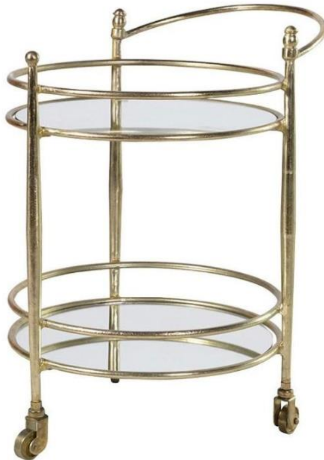
Spiral glass trolley £263, by Sweetpea & Willow ( sweetpeaandwillow.com )

"We try and make the furniture layouts as open as possible, so if you've got people cooking and others sitting on sofas, you can communicate between the two," Neathercoat says. "I also wanted to give people the opportunity to hide TVs and other everyday paraphernalia, so if you wanted a clean-looking entertaining space everything was cleverly tucked away. It's as practical as possible while maintaining the wow-factor."