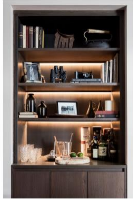
Wardour Street project by Design Haus Liberty: - Photograph by Philip Durrant