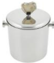
A BY AMARA Natural Agate Ice Bucket