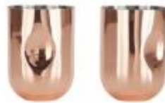
TOM DIXON Plum Moscow Mule Copper Mug