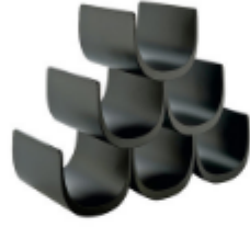
ALESSI Noè Modular Bottle Holder