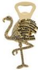
JOANNA BUCHANAN Flamingo Bottle Opener