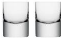
LSA INTERNATIONAL AL Boris Tumblers - Set of 2