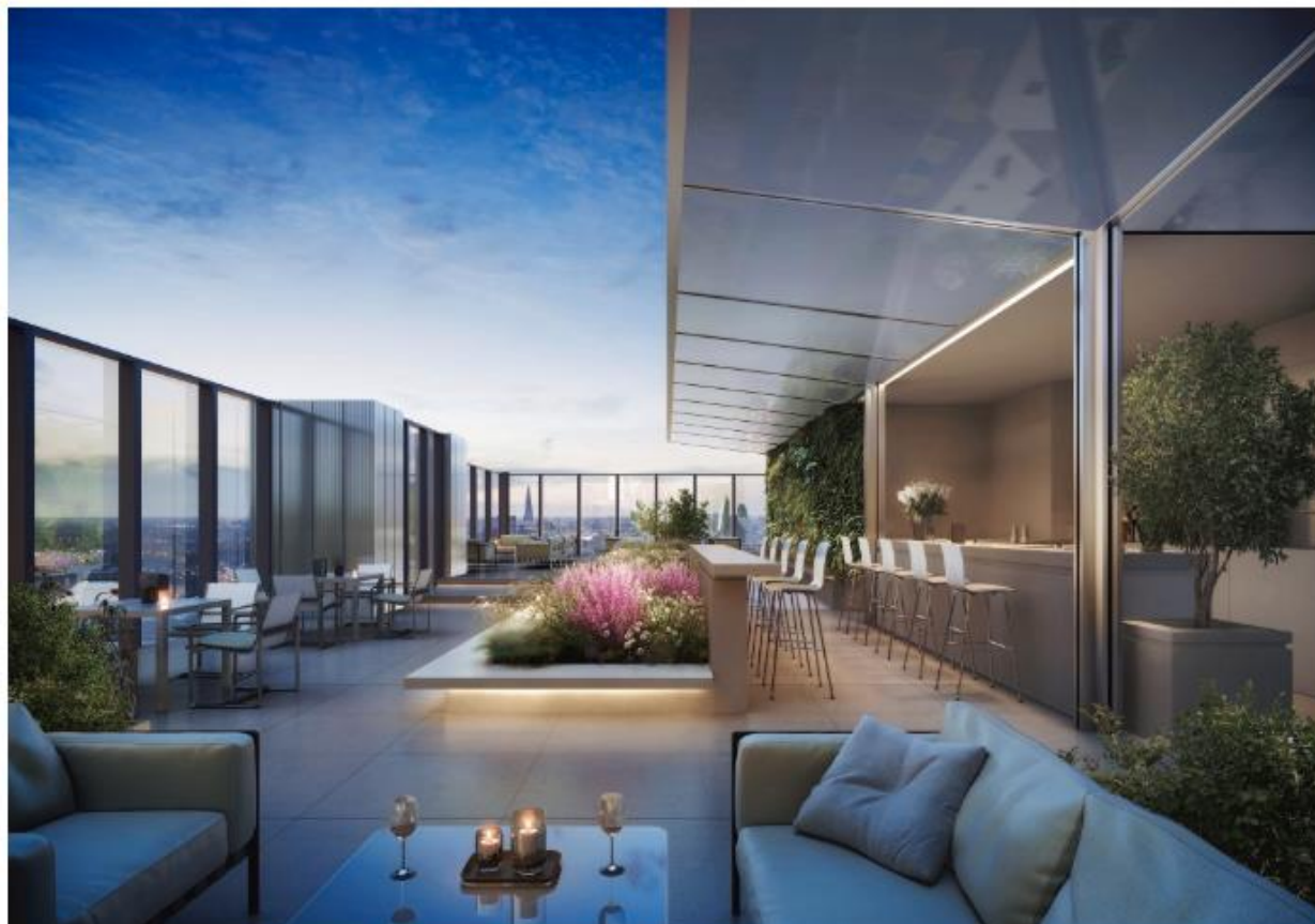
South Quay Plaza

This is one of the reasons why we are creating an amazing bar and lounge at South Quay Plaza. The concept of a home bar is nothing new but having an exclusive bar just an elevator ride away from where you live takes this to a whole new level. We've carefully considered how our residents will be living in the homes we build, how and where they are socialising and what they want from their home. There are some home owners who want to host but without all the fuss that goes with it, having a private bar in your building gives you access to the most trend setting cocktail mixologist who can create a signature drink in just seconds; no doubt making you the envy of your friends."