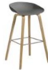
HAY Oak Stool - Matt Grey