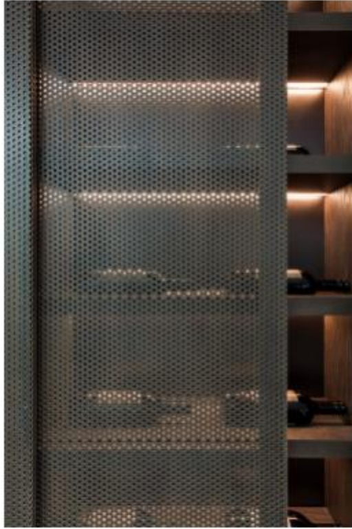
Wardour Street project by Design Haus Liberty: - Photograph by Philip Durrant

Park Crescent apartment project, London (Title Image)