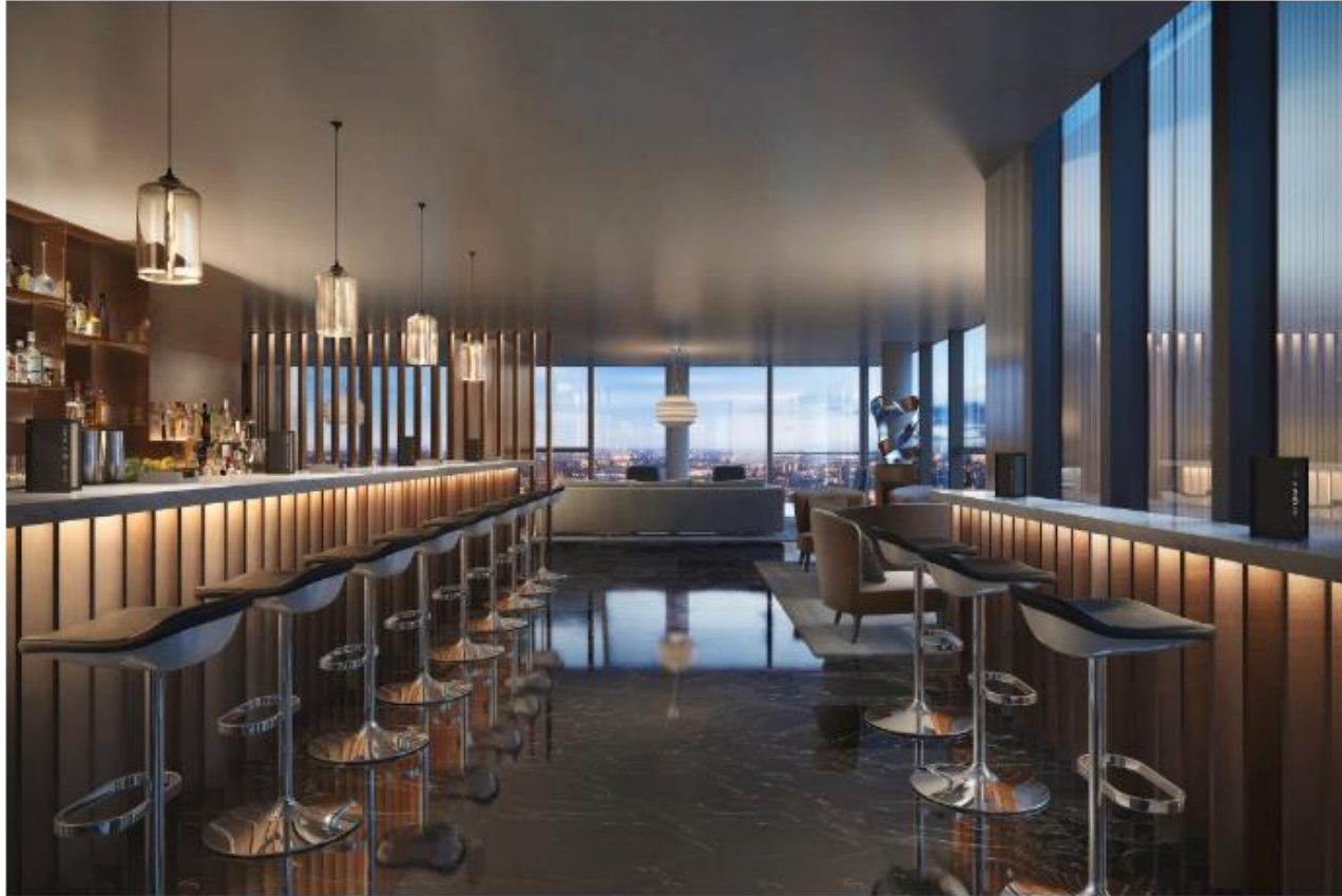
South Quay Plaza

"Luxury lifestyle is about having choices and having the best of these at your fingertips. Being able to enjoy a drink in the luxury of a bar on your doorstep allows you all the indulgence without any of the inconvenience. There is something special that makes an occasion out of still 'going out' but with all the comfort of 'staying in'.