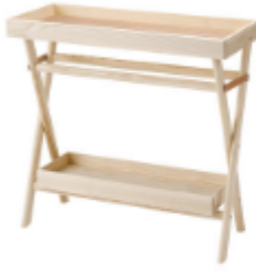
LSA INTERNATION AL Mixologist Cocktail Table